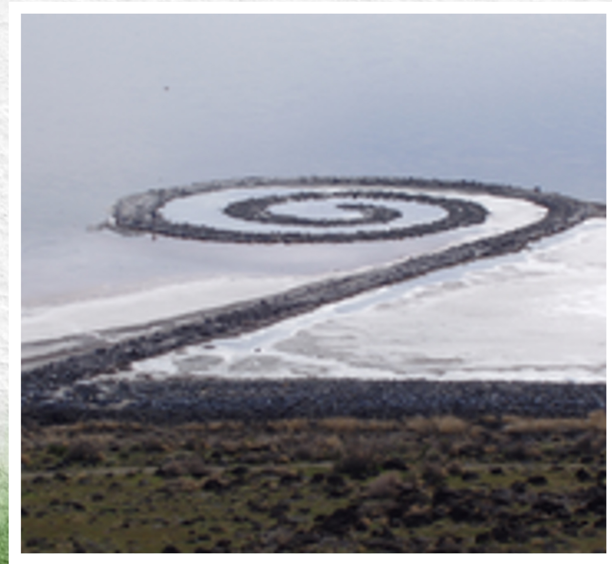
Robert Smithson, "Spiral Jetty" (1970)