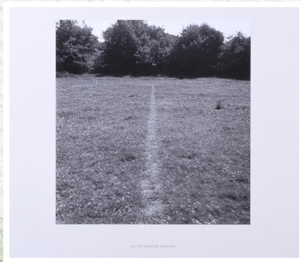
Richard Long, "A Line Made By Walking" (1967)